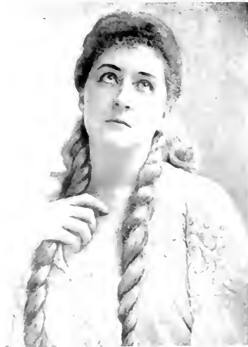
EMMA HAYDEN FAMES.

FAMES, Emma Hayden, operatic singer, known in private life as Mrs. Julian Story, born in 1857, in China, where her father held a diplomatic post. Her parents were natives of Maine and residents of Boston, Mass., where her father practiced law before going into the service of the government in Shanghai, China, where Emma was born. After the family returned to Boston, Emma began